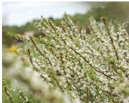
JADE PARADE ® SAND CHERRY ZONES 3-7