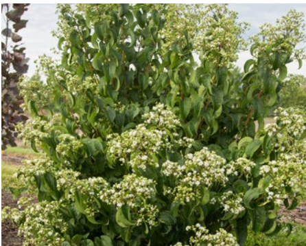
TIANSHAN ® SEVEN-SON FLOWER ZONES 5-9