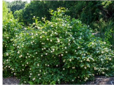
FIBER OPTICS ® BUTTONBUSH ZONES 4-9