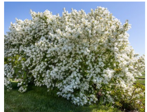
LOTUS MOON ™ PEARLBUSH ZONES 3-7