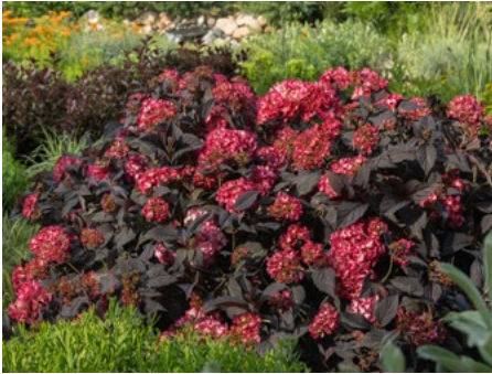
ECLIPSE ® BIGLEAF HYDRANGEA ZONES 5-9